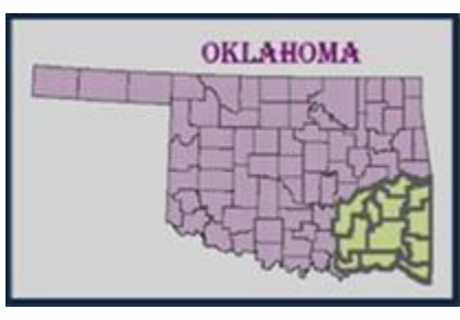
Location: Choctaw Nation of Oklahoma

The Choctaw Nation of Oklahoma (CNO) is a federally recognized Tribe, with a 10,992 sq. mile tribal reservation, comprised of a 13-county service area in southeastern Oklahoma. The CNO Reservation